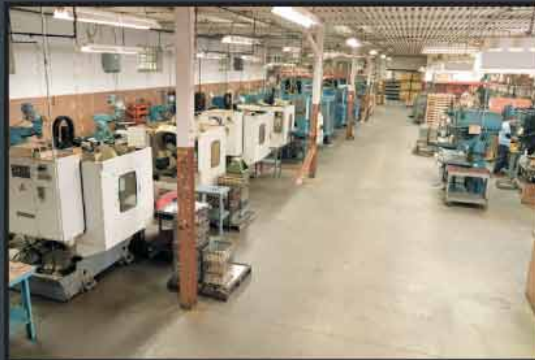
Eight (8) CNC Milling, Drilling and Tapping Centers.