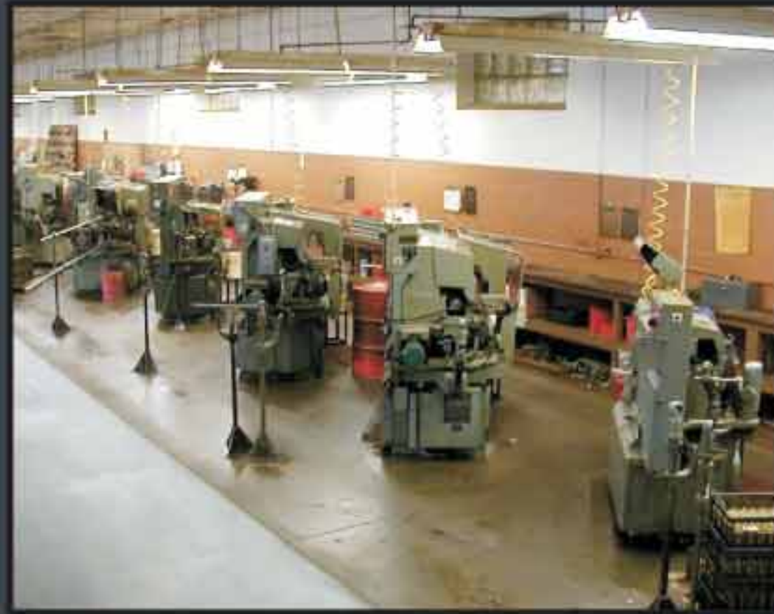
Partial view of our 13 Single-Spindle Screw Machines.

At Krenz Krist Machine the key to on-time delivery is production and scheduling flexibility. Under one roof we have 24 multi-spindle screw machines, 13 single spindle screw machines, 5 CNC turning centers, 8 CNC milling centers and a host of support equipment. With this much equipment we have the ability to be flexible in the way work flows through our facility. It is this flexibility that keeps us shipping on-time.