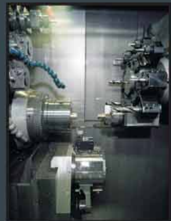
Close up of our 5-Axis CNC Machine Center.