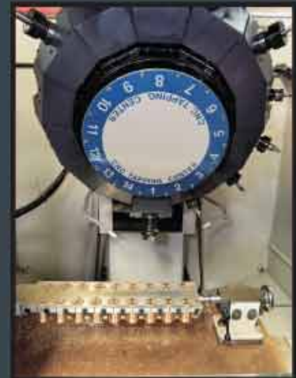
Close-up of one of our CNC Drilling Machines.