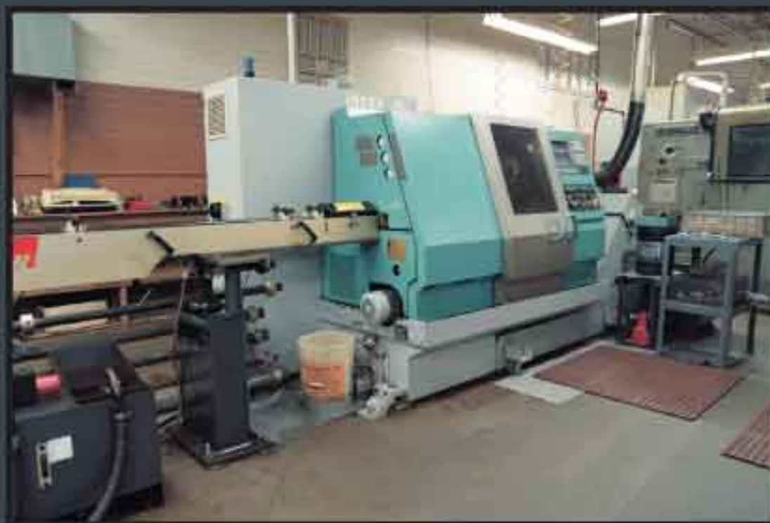
5-Axis CNC Turning Machine with live tooling and back working, capable of producing complex parts in one operation.