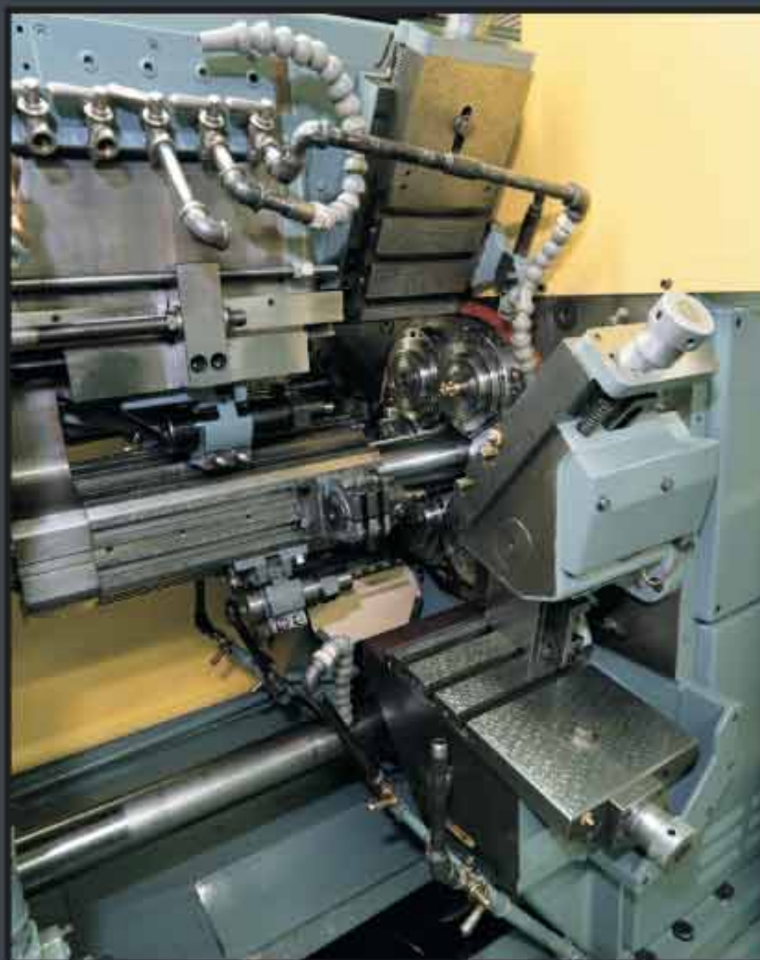
We have a complete in-house machine rebuilding program. This insures that we are always producing the highest quality parts for our customers.