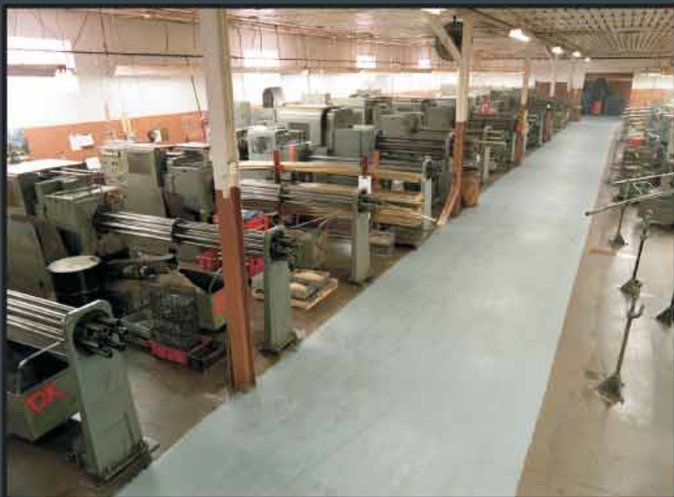
Krenz Krist services it's customers with 24 Multi-Spindle Screw Machines at our Cleveland facility. Shown is a partial view of our Multi-Spindle Screw Machines in Building A.