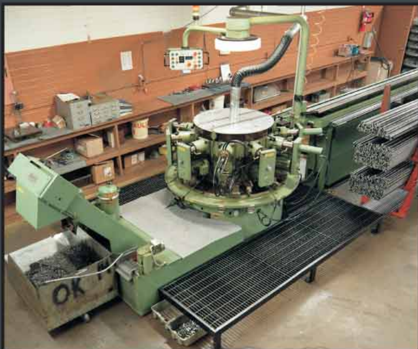
Rotary Transfer Machine designed to produce complex parts in high volume.

Krenz Krist Machine is a third generation family run business. Since 1967 we have grown from a tiny two man operation to a full service job shop that can handle all your precision machining needs. From prototype to high volume production we have the right equipment for the job. When you call Krenz Krist Machine the person at the other end of the phone will have a personal vested interest in your total satisfaction. We know that to keep you coming back we must deliver QUALITY parts, ON-TIME and at COMPETITIVE prices.